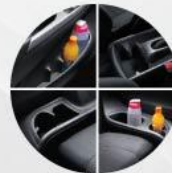
BOTTLE HOLDER & MULTI STORAGE