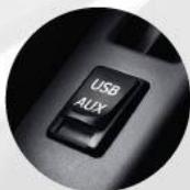
USB HUB & AUX IN