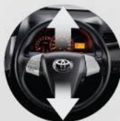
STEERING SWITCH & TILT STEERING