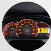
COMBINATION METER WITH MULTI INFORMATION DISPLAY (MID)