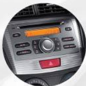
2 DIN AUDIO CD MP3