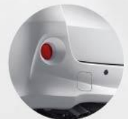
PARKING SENSOR WITH REAR REFLECTOR